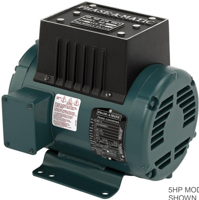
5HP MODEL SHOWN

RUNS THREE-PHASE EQUIPMENT FROM SINGLE-PHASE POWER SOURCE