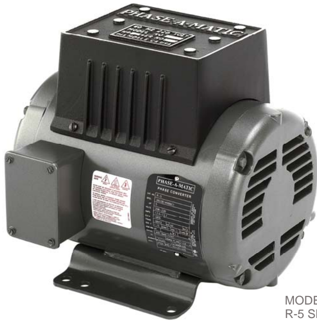
MODEL R-5 SHOWN

RUNS THREE-PHASE EQUIPMENT FROM SINGLE-PHASE POWER SOURCE