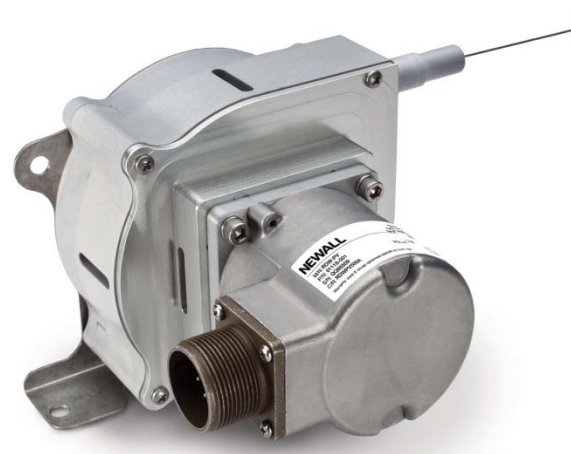
Made in USA